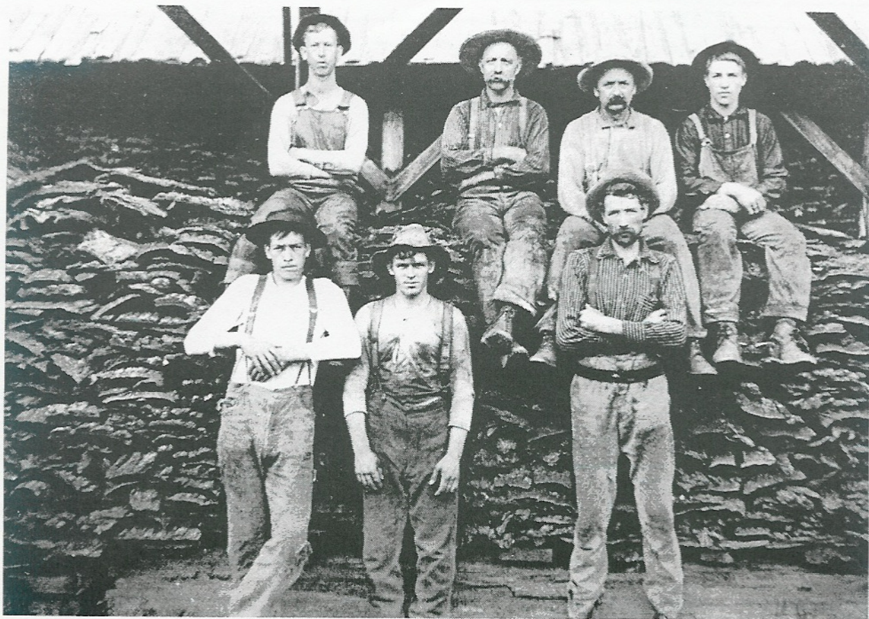
An unidentified group of tannery workers, sitting and standing, at a pile of bark ready for the soaking vats.