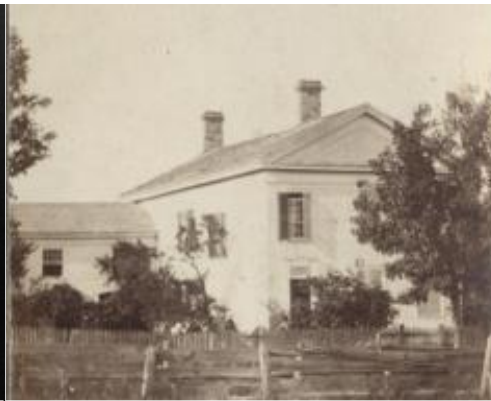
Holy Child of Jesus Convent Towanda, PA 1862